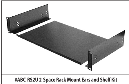
#ABC-RS2U 2-Space Rack Mount Ears and Shelf Kit

Mounts in standard EIA 19" rack with an open front space up to 17-3/16" wide and an 11" front to back depth.