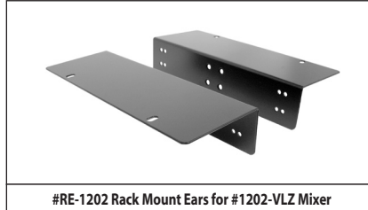
#RE-1202 Rack Mount Ears for #1202-VLZ Mixer