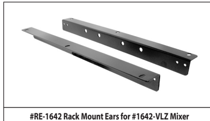
#RE-1642 Rack Mount Ears for #1642-VLZ Mixer